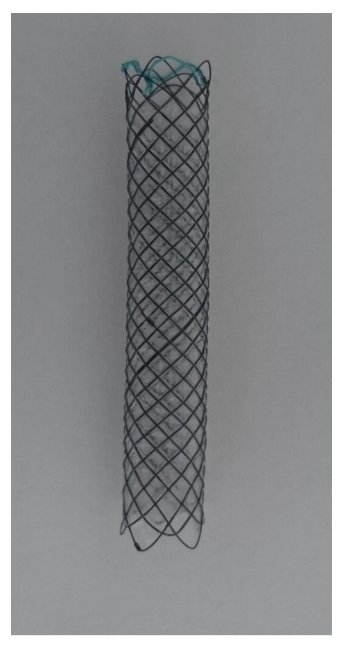
Figure 7. Fully covered metallic biliary stent.

SEMS are made of different metal alloys ranging from 4 to 12 cm in length with diameters when expanded ranging from 6 to 10 mm. All SEMS are radiopaque. Most models have additional proximal and distal markers, with flared ends to prevent migration [30]. As in the case of digestive tract stents, biliary metallic stents can be fully covered, partially covered or uncovered (Figure 7).