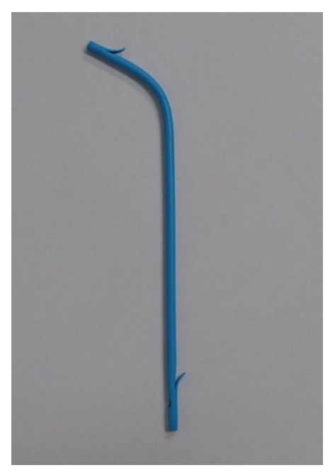
Figure 5. Angled biliary plastic stent.