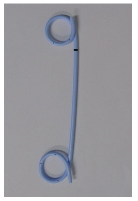
Figure 6. Double pigtail biliary plastic stent.