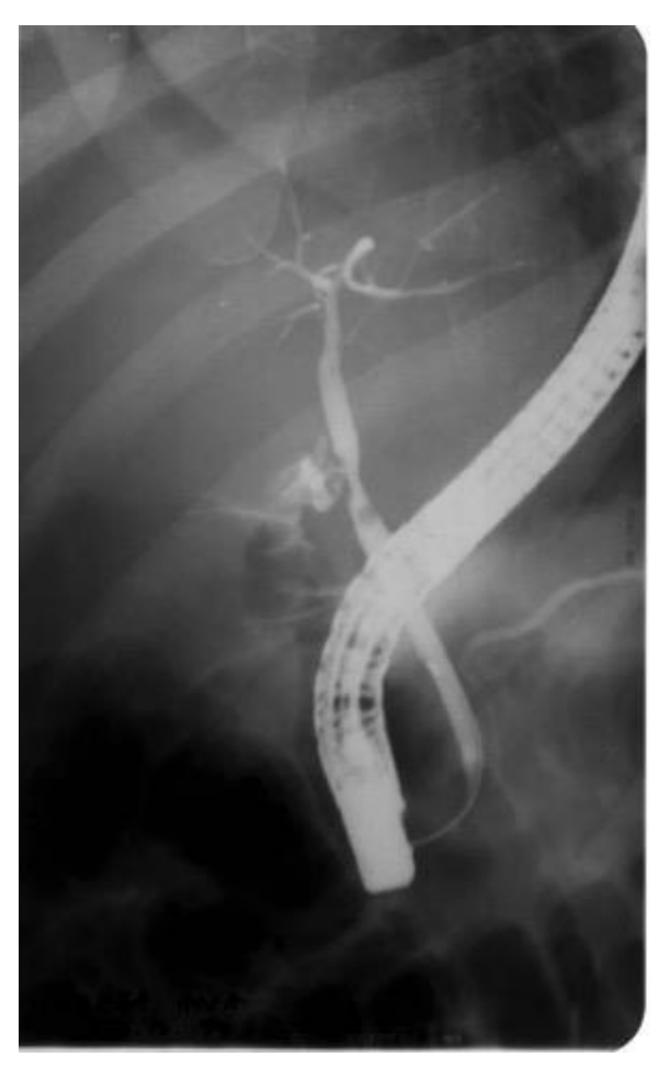
Figure 3. Iatrogenic fistula after cholecystectomy. Arrow points to the extravasation of contrast from the biliary tree.

Most patients with biliary fistulae can be treated endoscopically using ERCP. In patients with a low-flow fistula, some studies recommend performing only endoscopic biliary sphincterotomy [29]. Its purpose would be to abolish the muscular component of the papilla, thereby decreasing the pressure in the bile ducts and favoring preferential duodenal drainage. However, in most cases, it is preferred to cover the fistulous opening with one or more stents, thus preventing extravasation of bile in the subhepatic space (Figure 2 and Figure 4).